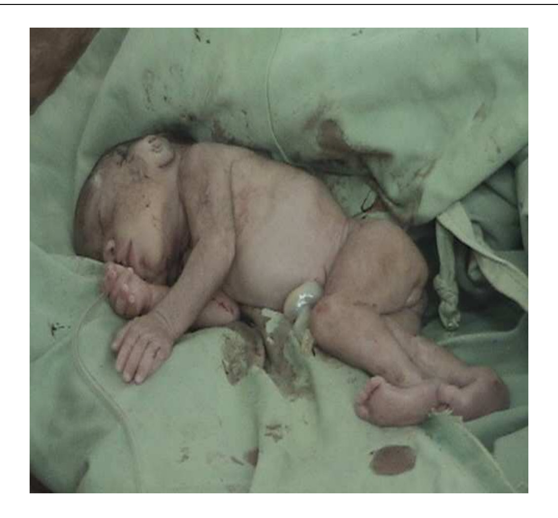
Fig.2: The fetus from abdominal pregnancy with multiple compression deformities