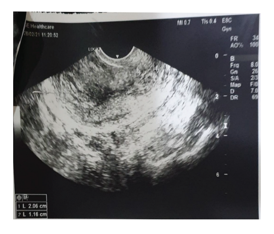
Figure 3, picture of TVS, 10 days after intervention showing shrinking cervical swelling

The cervical swelling also continued to subside. (Figure 3). She experienced dark menstruation like bleeding on the third week after the intervention which subsided by itself.