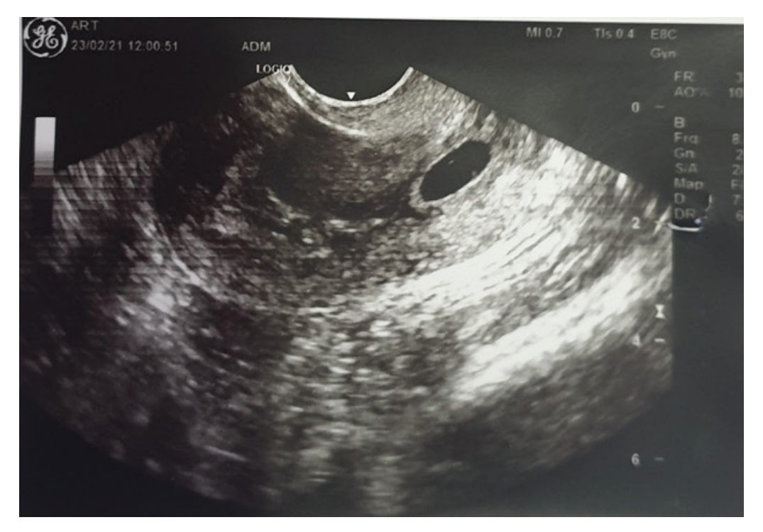
Figure 1. A transvaginal image a cervical pregnancy. Note a gestational sac on the posterior wall of the cervix below the level of the internal os.

endometrial cavity and a gestational sac of 2 x3 cm in the posterior wall of the cervix below the internal os and with a yolk sac and fetal pole but no visible FH activity (Fig 1). Sliding sign was negative. There was adequate blood flow around the sac.