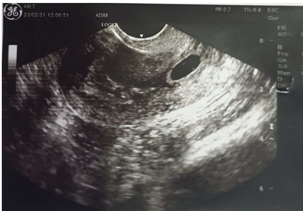
Figure 1. A transvaginal image a cervical pregnancy. Note a gestational sac on the posterior wall of the cervix below the level of the internal os.

endometrial cavity and a gestational sac of 2 x3 cm in the posterior wall of the cervix below the internal os and with a yolk sac and fetal pole but no visible FH activity (Fig 1). Sliding sign was negative. There was adequate blood flow around the sac.