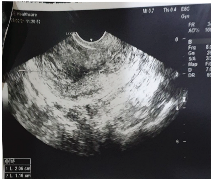
Figure 3, picture of TVS, 10 days after intervention showing shrinking cervical swelling

The cervical swelling also continued to subside. (Figure 3). She experienced dark menstruation like bleeding on the third week after the intervention which subsided by itself.