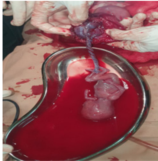
Figure 5 Fetus with placenta

The hemoperitoneum was evacuated and the fetus and the placenta were removed (figure 5). Ipsilateral round ligament was clamped, cut and ligated. Mesosalpinx serially clamped, cut and ligated. The ruptured rudimentary horn was clamped and resected at its base and hemostasis was secured. After the resection the sample was checked and showed no communication between the rudimentary horn and Unicornuate uterus. The abdominal cavity was cleaned and closed in layers. Intraoperatively, a diagnosis of ruptured non-communicating rudimentary horn of unicornuate uterus was made. She was transfused with three units of whole blood. The operative period was uneventful and she was discharged on her third postoperative day with ferrous sulfate tablets, advice and counseling.