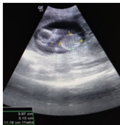
Figure 2 Alive fetus, BPD 17wks