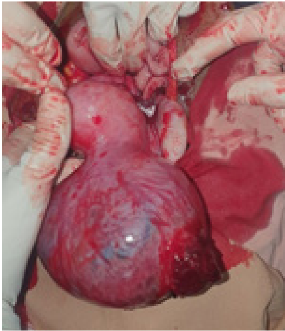
Figure 3 Unicornuate uterus with ruptured rudimentary horn pregnancy

Intraoperatively a right unicornuate uterus with a normal ovary and fallopian tube was found. To the left there was a rudimentary horn of uterus with fetus and placenta inside but ruptured on the posterior wall with active bleeding. The ipsilateral fallopian tube, ovary, and round ligament were normal. (Figure 3, 4)